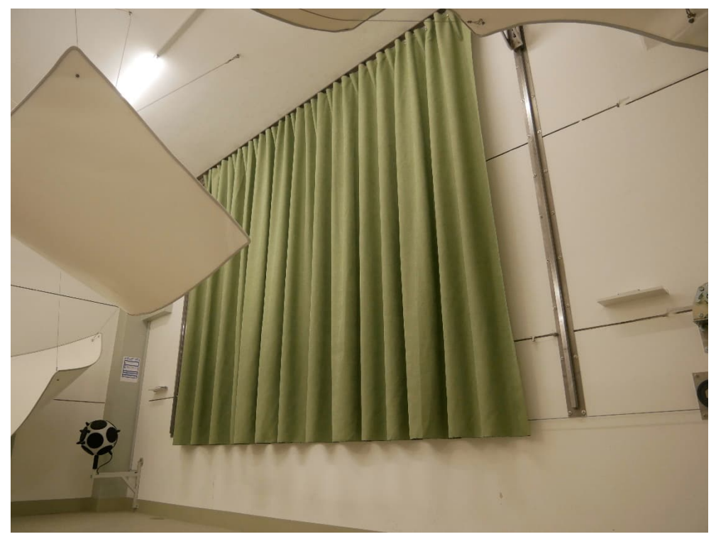
Figure B.2. Test object mounted in the reverberation room, diagonal view.